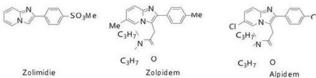
Scheme 1. Biologically related formulas imidazo[1,2- \alpha ]pyridines

benzene with ketones or alcohols, (18) \alpha -diazoketones, (19) and propargyl bromide (20). Although these methods are suitable for certain synthetic conditions sometimes, however, some of these procedures are associated with one or more disadvantages such as high cost, use of stoichiometric and even excess amounts of reagents or catalysts, long reaction time, dangerous organic solvents, low yield, which leaves scope for further development of new environmentally clean syntheses (22). Therefore, there is an increasingly necessity for advanced and newer routes of synthesis of imidazo[1,2- \alpha ] pyridines (21).