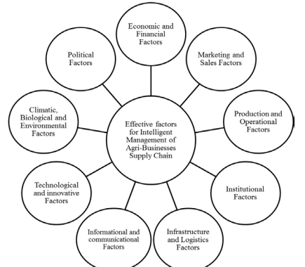
Figure 2. Initial Model for Intelligent SCM of Agri-Businesses.

of agri-businesses in the northern provinces. Figure 2 presents the initial model based on these main factors.