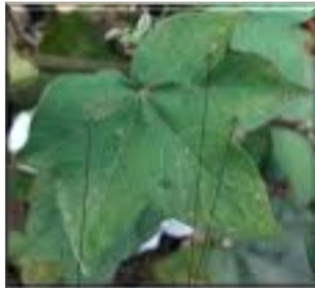
Figure 5. Symptoms of cotton Curvularia leaf spot disease

The symptoms of this disease are in the form of brown spots with a yellow border, which are egg-shaped. The symptoms of this disease are in the form of brown spots with a yellow border, which are egg-shaped (Figure 5).