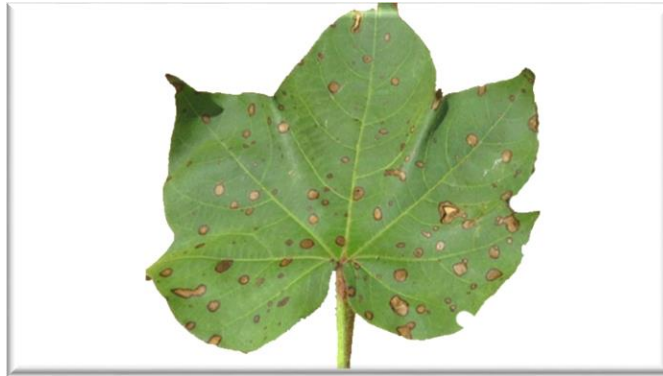
Figure 2. Symptoms of cotton Alternaria blight disease