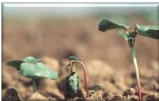
Figure 1. Symptoms of cotton seedling damping-off disease

The symptoms of seedling seed rot disease appear in the form of seedling death before and after germination, seed rot in the soil before germination, ring rot, brown spots in the axis of the cotyledons, spots on the leaves in the form of burns, etc (Figure 1).