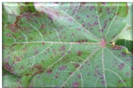
Figure 6. Symptoms of cotton Cercospora leaf spot disease