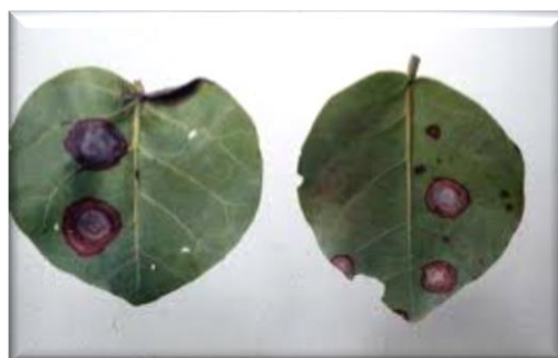
Figure 4. Symptoms of cotton Helminthosporium leaf spot disease

The symptoms of this disease are in the form of round and light brown spots, which become dark and gray after a while are painted. If Helminthosporium leaf spot contamination is high, the leaves will fall prematurely (Figure 4).