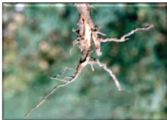
Figure 10. Symptoms of cotton Charcoal rot disease

Yellow or pink spots on the leaves, blackening of the roots, drying of the leaves on the plant, softening of the infected parts and their falling due to the wind are the symptoms of charcoal rot disease, the most important of which is the rotting and blackening of the root end (Figure 10).