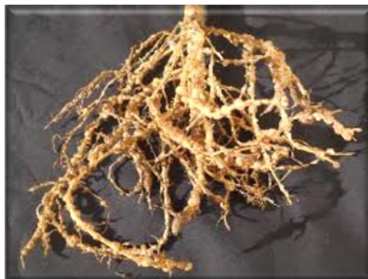
Figure 20. Symptoms of cotton Root-knot nematode