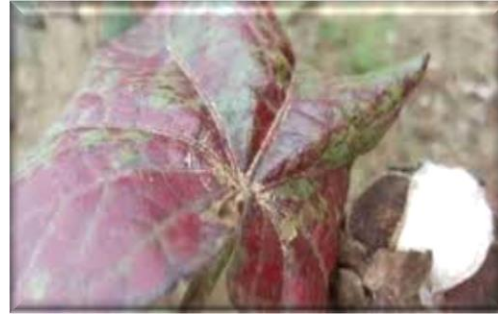
Figure 19. Symptoms of cotton Red leaf disease

spread to young leaves. If the disease is severe, cotton leaves may turn red, the leaves of the plant should fall (Figure 19).