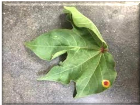
Figure 9. Symptoms of cotton Rust disease