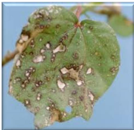
Figure 3. Symptoms of cotton Ascochyta blight disease