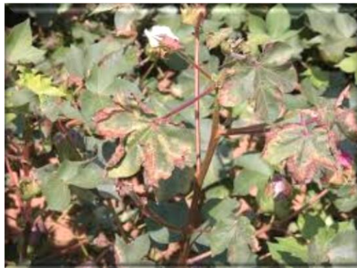
Figure 11. Symptoms of cotton Fusarium wilt disease

The symptoms of this disease are wilting of seedlings, yellowing of leaves, dwarfing of seedlings, curling of the edges of the leaves upwards. Leaves dry and hang. In case of severe contamination of cotton with fusarium wilt of tissues in a ring it changes color and causes the loss of seedlings (Figure 11).