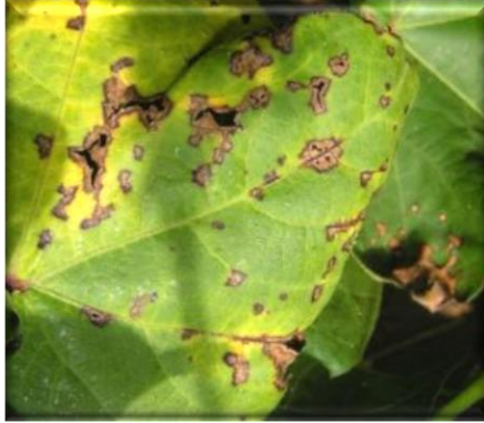
Figure 16. Symptoms of cotton Bacterial stem blight disease