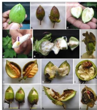
Figure 14. Symptoms of cotton internal boll rot disease

Rot inside the boll, falling of the boll, reduction in size and weight of the boll, yellowing or browning of the fibers, secretion of slimy and milky liquid, changing the color of the bolls to orange are the symptoms of internal rot disease of cotton bolls (Figure 14).