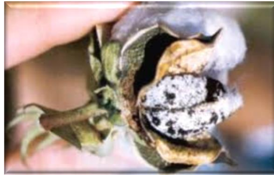
Figure 13. Symptoms of cotton Boll rot disease