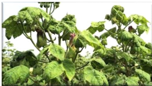
Figure 18. Symptoms of cotton Leaf curl virus

The symptoms of the viral disease of cotton leaf curl are the decrease in the number of bolls in the plant and the weight of the bolls. Also, in the infected plants, the level of photosynthesis is reduced and the leaves turn yellow. The amount of damage is different in different fields and cultivars, and as it was said, the greatest amount of damage caused by this disease is in the early stages of plant growth (Figure 18).