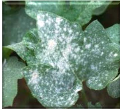
Figure 8. Symptoms of cotton Powdery mildew disease

Wrinkling of the leaf blade, reddening of the plant and white coating on the back of the leaf are the symptoms of the white powdery mildew disease in cotton (Figure 8).