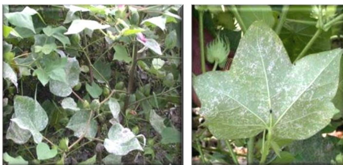
Figure 7. Symptoms of cotton Grey or Areolate mildew disease

The symptoms of this disease are light green to yellow spots on the surface of the leaf and fluffy white spots under the leaf. In case of severe infection of cotton with grey mildew disease, the spots on the leaves turn white (Figure 7).