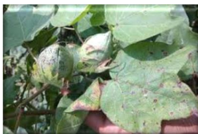
Figure 15. Symptoms of cotton Antracnose disease

This pathogen infects all aerial parts of the plant. Symptoms of cotton anthracnose include brown spots on the leaves which are sometimes red, there are brown spots on the stem and boll (Figure 15).