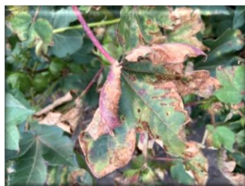
Figure 12. Symptoms of cotton Verticillium wilt disease

leaves, shrinking of the edge of the leaf towards the top of the leaf, dwarfing and changing the color of the texture, hanging of the leaves, severe falling of leaves and bolls, and drying of the plant (Figure 12).