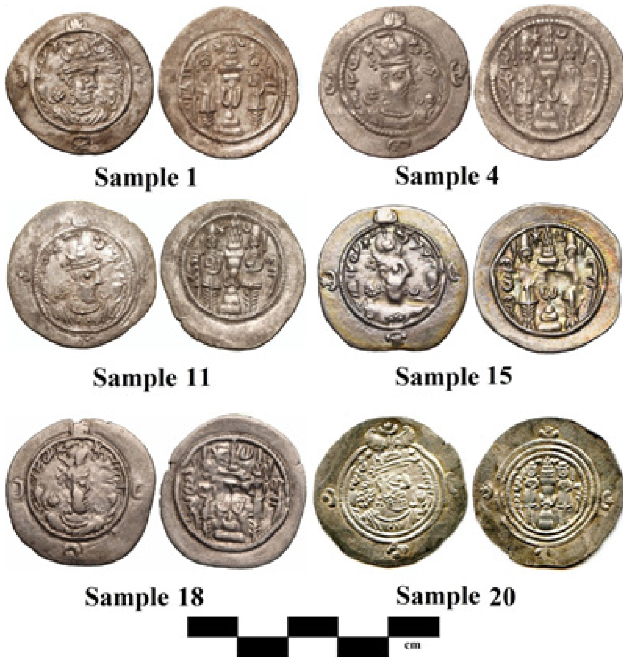
Fig 1: Sasanian silver coins: Hormizd IV (samples 1-4-11-15, Khosrow I (sample18), KhosrowII (Sample 20)