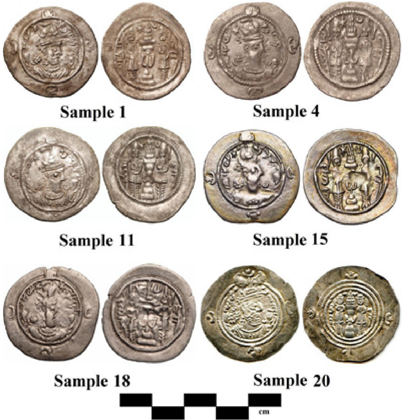
Fig 1: Sasanian silver coins: Hormizd IV (samples 1-4-11-15, Khosrow I (sample18), KhosrowII (Sample 20)