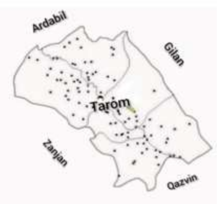
Figure 1. Tarom County Location

To ensure an adequate sample size for the study, the researcher initially identified two experts using targeted sampling methods. Subsequently, using snowball sampling techniques, this number was increased to 40. Going forward, it is planned to continue increasing the sample size until reaching theoretical saturation limits. The use of snowball sampling methods will be employed to achieve this goal. This approach will allow us to capture a broad range of perspectives from across our diverse statistical population while ensuring that our research is both comprehensive and robust.