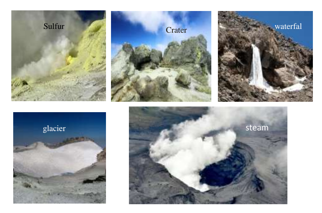
Fig 2. Images of Mount Damavand with related phenomena