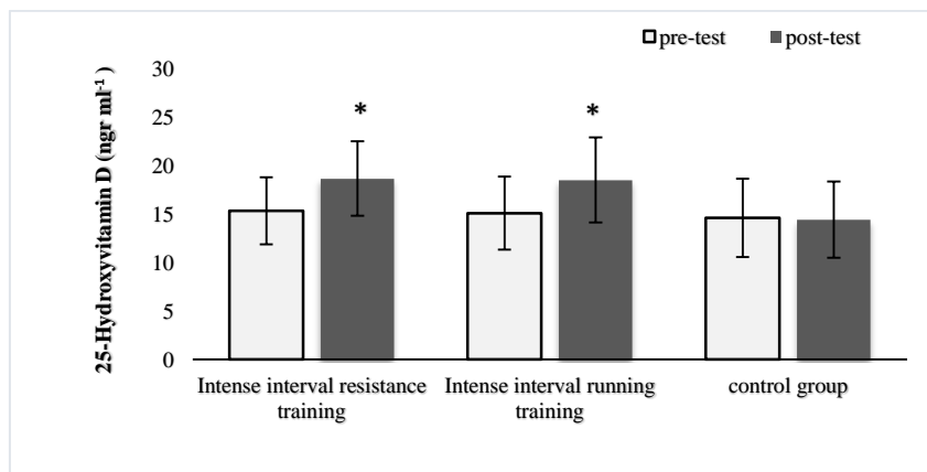
Figure 2. Comparison of serum levels of 25-hydroxy vitamin D of the research groups in the post and pre-test

*: sign of significant difference compared to before training