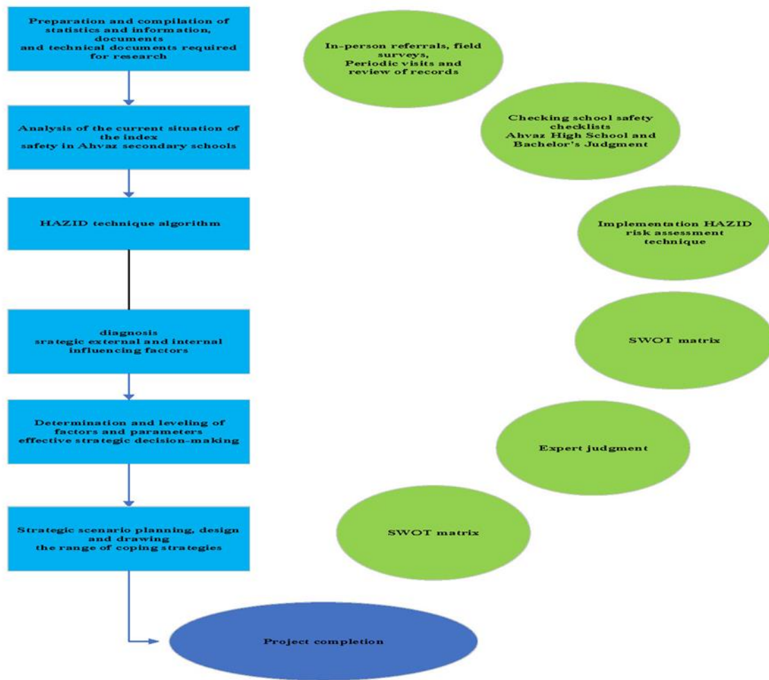
Fig. 1 Flowchart of the study stages