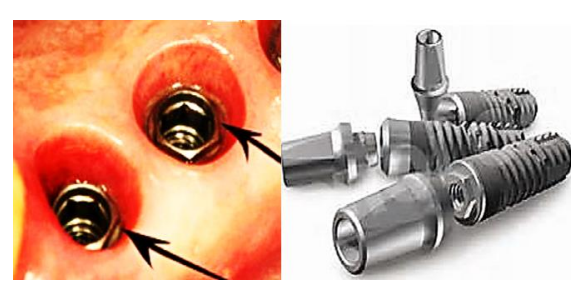
Fig. 2 The screw and titanium implant for dental application

The titanium fuses well with the jawbone during a process called implantation in which during this process, titanium becomes part of the bone and attached to the host bone as shown in Fig. 2 [38-44].