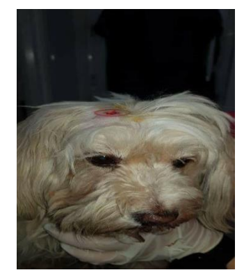
Figure 1. Solitary yellowish hue 9-mm papule endophytic growth on the calvarium in the right midline of the canine mixed breed terrier.

In May 2021, a 5-year-old ovariohysterectomized female Terrier mixed with a weight of 3.7 kg was referred to the veterinary clinic of the Islamic Azad University, Shahrekord Branch with