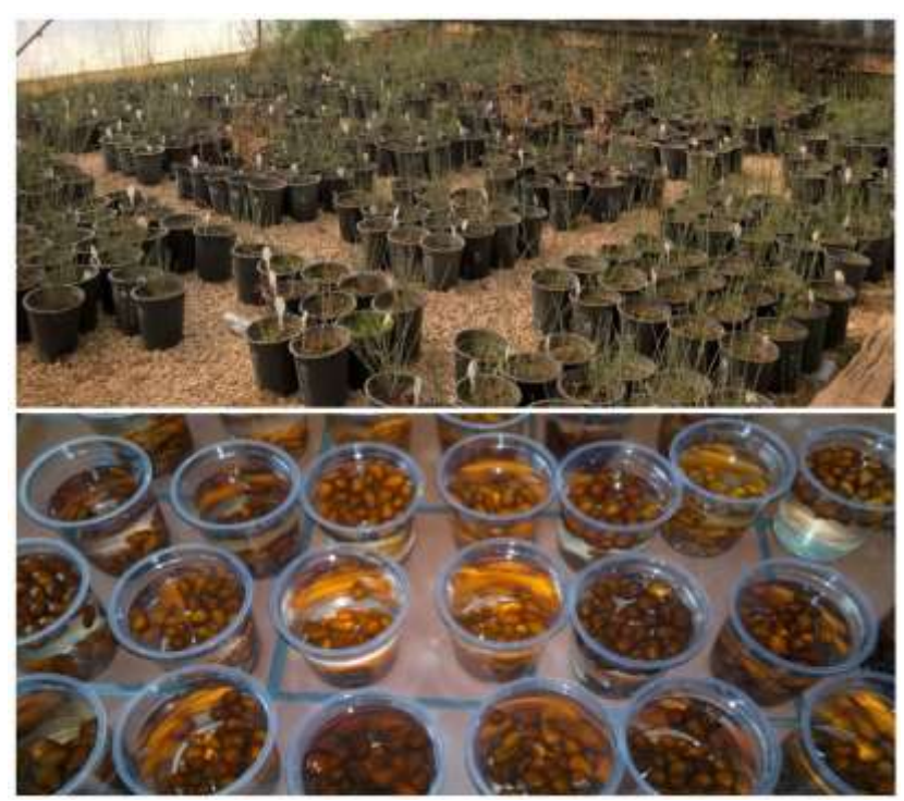
Fig.2. Nut samples soaked in water to be used in raising seedlings (down) and raised seedling after one year of growth in greenhouse condition (top).

was measured after drying samples for 72 h at 70°C, using an electronic balance with 0.001 g precision. Leaf ash weight was also measured after subjection samples to 500 °C for 4 h in an electric oven. Leaf area (mm^2) was determined using a leaf area meter (Delta-T devices, Ltd., Cambridge, UK).