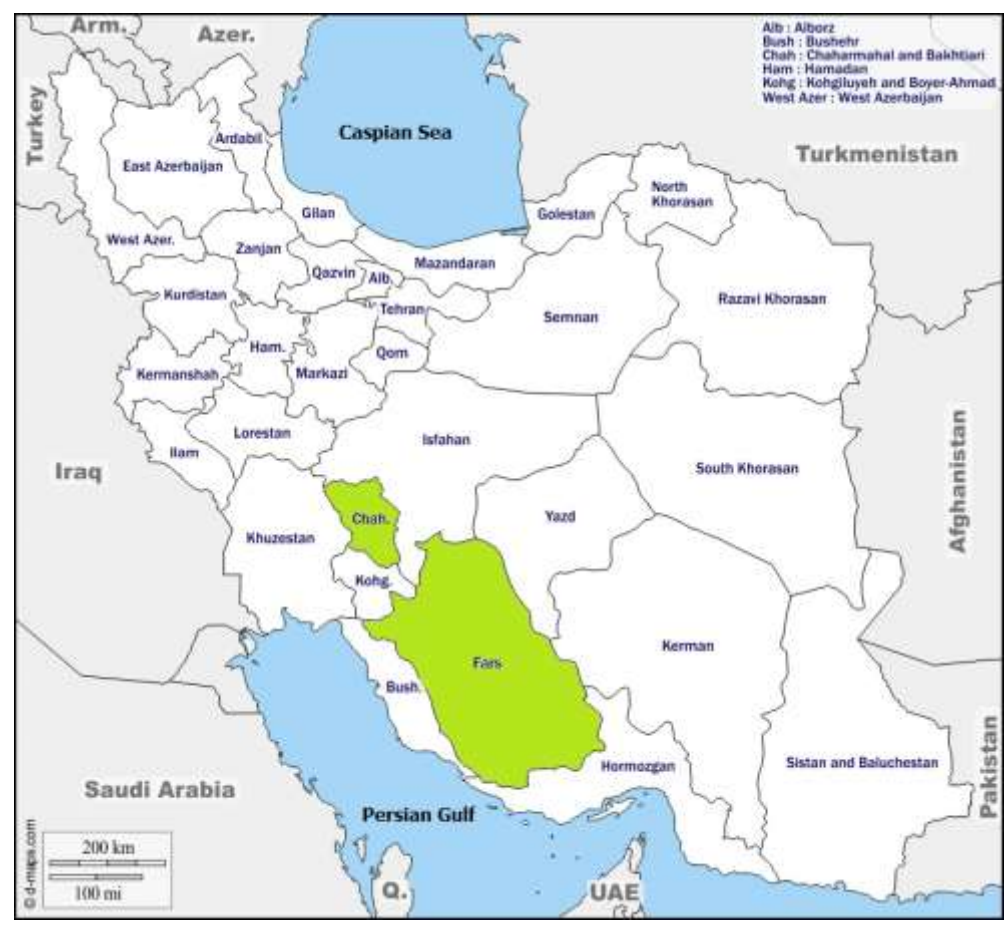
Fig. 1. Approximate distribution of almond species and populations habitats in Iran that used in this study (the green colored provinces). The original map is obtained from d-map (https://d-maps.com/carte.php?num_car=5496&lang=en_and modified (colored) using paint software of Microsoft Windows