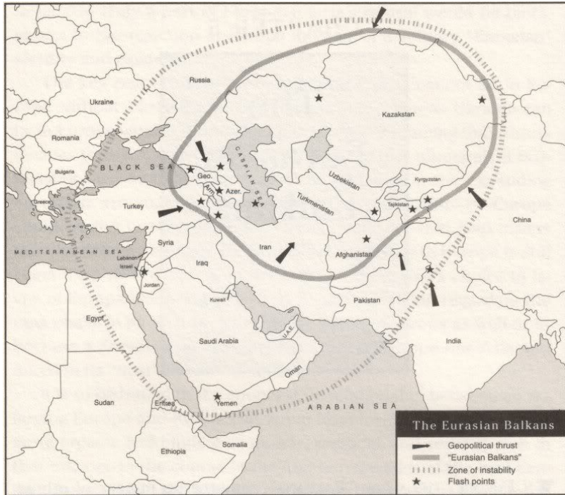
Map.N.2: Eurasian Balkans (Brzezinski, 1997: 53)