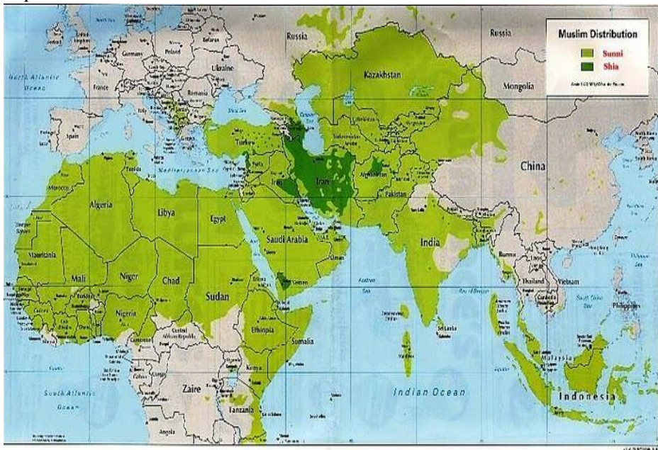
Map. N.3: The Geopolitics of Muslim world and the Shia phenomenon in the centre ( http://www.lib.utexas.edu/maps/world_maps/muslim_distribution.jpg )

has the world's fate in its hands, in the current situation and in the future. Therefore, controlling this region is of extraordinary importance. Gas resources of this region are also, like oil, in the centre of attention of geo-economical theorists. Other reason for the importance of Rimland is due to the consumer markets. Consumption-orientation of countries of this region has led to the emergence of a great competitive market among producing countries. Oil-producing countries (except Iran) are mainly single-product, and by relying on their huge oil revenues, and by buying consumer goods, restore money to the industrial oil alliance countries. Their consumer goods include a vast spectrum, from the primary necessities to the modern tools of war and cultural goods based on the culture industry (Horkheimer & Adorno, 1987: 146) and mass production.