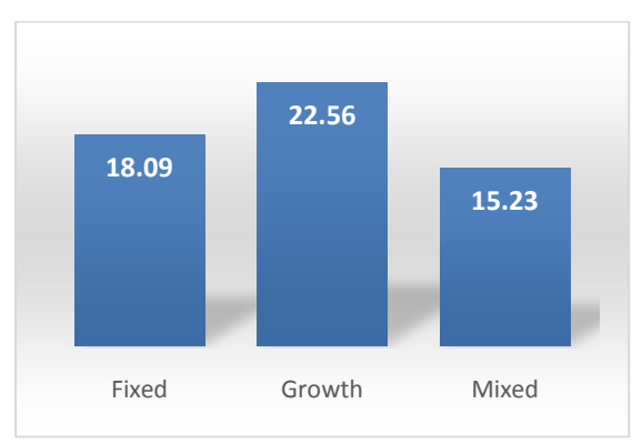
Figure 4: Means on posttest of grammar achievement by groups with pretest

B: The growth-mindsetting group (M=22.56) significantly outperformed the fixed indsetting group (M=18.09) (Mean Difference = 4.46, p < .05). C: The fixed-mindsetting group (M=18.09) significantly outperformed the mixed-mindsetting group (M=15.23) (Mean Difference = 2.86, p < .05).