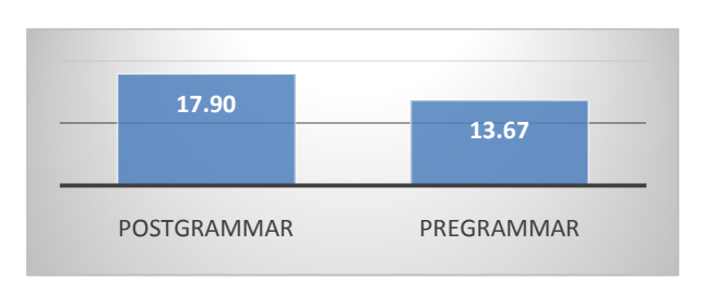
Figure 1: Pretest and posttest of grammar (fixed-mindsetting group)