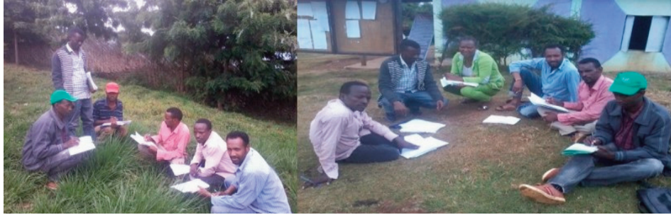
Figure 3. During FGD with woreda SMSs

practice. Their words are not trustworthy, and they bring false reports to the woreda.”