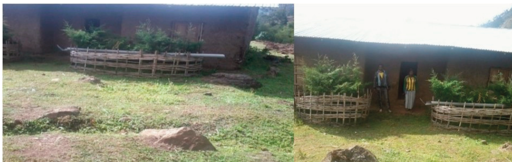
Figure 2. Ambi kebele demonstration site and DAs residence during a field survey