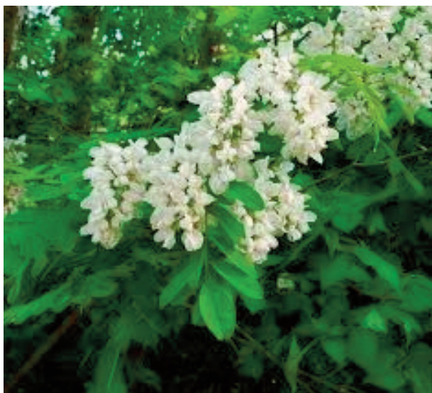
Fig. 2. Robinia pseudoacacia .