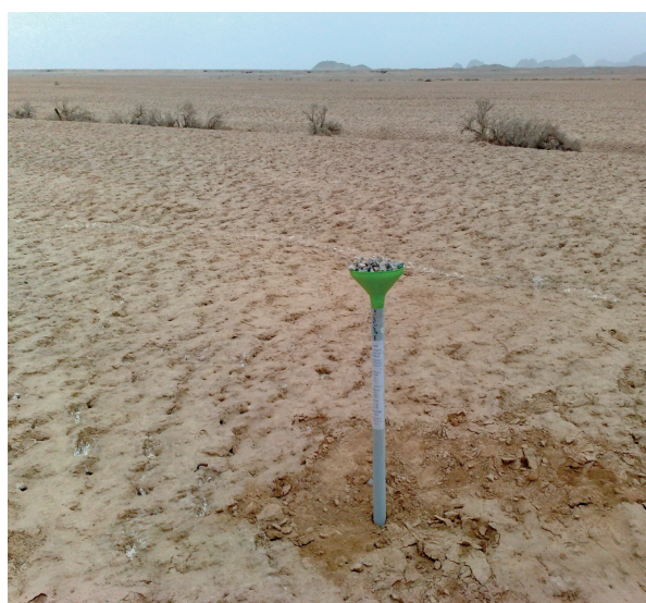
Fig. 3. Specimen of the Marble Dust Collector.