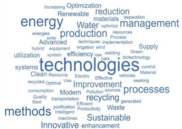
Fig. IV. Word cloud of technology theme

efficiency. Additionally, due to the lack of high-performance machinery and equipment in the country, it is challenging for managers to implement GM in their corresponding industries. Many of these managers have established their industries in the desert and sunny areas and use solar energy for hot water or electricity for at least administrative units, which is one of the most straightforward steps in this field. However, the current U.S. sanctions have made it difficult to replace these systems with new high-performance