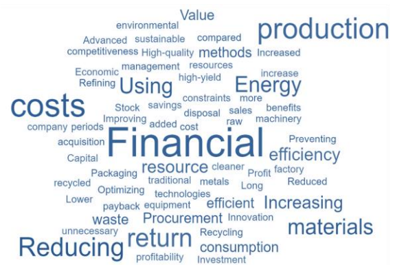
Fig. III. Word cloud of economic theme