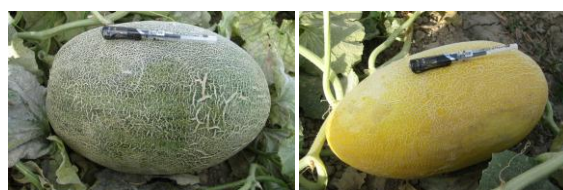
Fig. 1. Iranian melon cultivars studied; 'Suski Sabz' (left) and 'Jalali Zard' (right).

The experiments were conducted in the greenhouse in Paris-Sud XI University (Orsay, France) with two commercial Iranian melons, 'Suski Sabz' and 'Jalali Zard' ( Cucumis melo L. Inodorous group). 'Suski Sabz' and 'Jalali Zard' have dark green and yellow fruits colours respectively (Fig. 1). Both cultivars have oval large-sized fruits weighing approximately 3 kg per fruit at harvest time. The seeds for experiments were collected from Iranian farmers in Garmsar. For early production, a transplant procedure was carried out. The seeds were sown in pot so that they produce 2 to 4 true leaves. After that, they were taken to the greenhouse bed. The cultivation conducted from June to September 2010. After pruning (cutting the main stem), all plants were