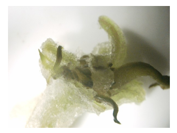
Fig. II. Shoot regeneration from callus MS medium containing 1.0 mg \Gamma^{1} BAP + 0.1 mg L^{-1} NAA

round supply of natural plant products, which may be more easily purified. Methods for the production of important components from plant cells have been developed in safflower, such as \alpha tocopherol (Ghasempour et al., 2012; Soheilikhah et al., 2013), although further research is necessary to improve their economic efficiency.