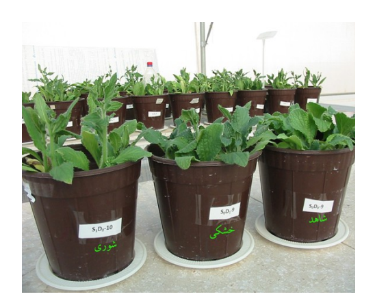
Fig. I. The borage under salinity stress

solution was then incubated at 100°C water bath for 1 h. The reaction was terminated by placing the mixture in an ice bath. It was then extracted with 4 ml toluene and the chromophore phase was aspirated from the aqueous phase. The absorbance rate was read at 520 nm using a spectrophotometer. Concentrations of proline in the leaves were expressed on a DW basis. The total soluble sugars were measured using the phenol-sulphuric acid. To measure total soluble sugars of the leaves, the solution of 5% ZnSO<sub>4</sub>, 0.3 % NB(OH)<sub>2</sub>, 5% (v/v) phenol solution and sulphuric acid were used based on Stewart method. Finally, absorption rate was read at 485 nm by spectrophotometry (Stewart, 1989). Concentrations of total soluble sugars in the leaf and root are expressed on a DW basis. Statistical calculations were done by SPSS 16 software. Mean values and significance were determined by Duncans multiple range tests at 5% probability level.