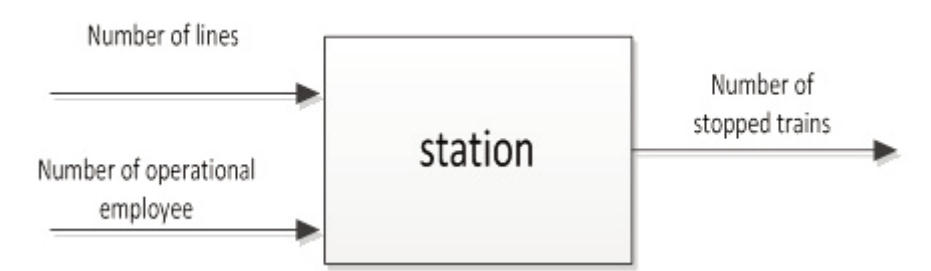
Fig.1. Schematic representation of the technical efficiency model for frights stations

At first, the efficiency of railway freight stations utilizing the existing capacity of the infrastructure at stations is measured. Hence, according to Mahmoudi et al. (2019), technical efficiency for railway companies can be defined as how infrastructure resources can be utilized, efficiently. The main infrastructure resource at freight stations is the number of operational lines. Another input for assessing the technical efficiency of railway freight stations is the number of operational employees in the stations. In this study, we take the number of freight trains stopped in the stations for giving services as an output. It can be extracted from working timetables. Fig. 1. illustrates schematic representation of the technical efficiency model for freight stations.