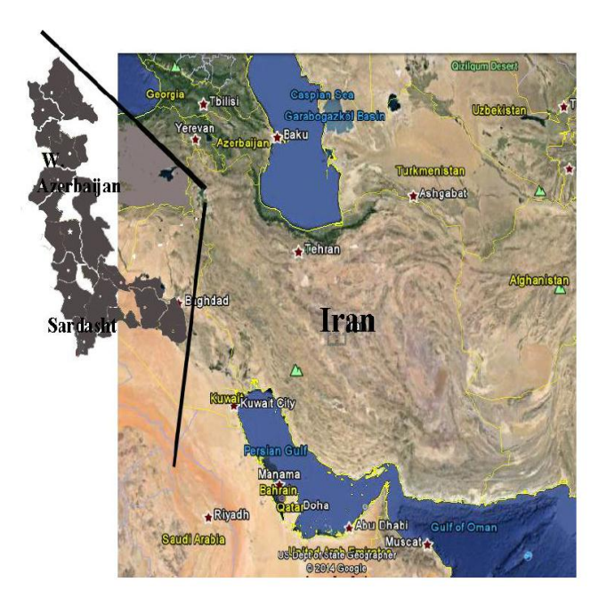
Fig. 1. Map of Iran, Western Azerbaijan province (gray color), Sardasht.

Unfortunately many plant species are endangered or become extinct before even a preliminary study. It seems that valuable nature resource is devastating rapidly (Fransworth and Morris, 1976; Fransworth et al. , 1985). Two type of medicinal plants are used in Iran: first a well identified group with a definite common name and a second group composed of unrecognized plants with empirical usage in different parts. So it seems necessary to study the medicinal plants more seriously (Poyan, 1989).