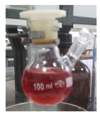
Figure 1: The rubrocurcumin solution.