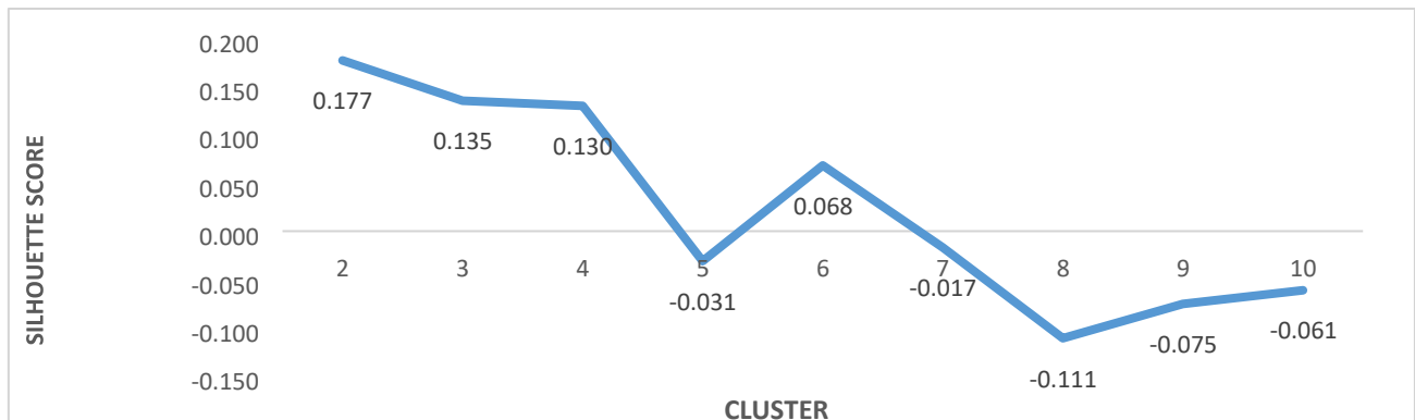
Figure 1. Results of first Clustering repetition

The highest silhouette scores were achieved by clusters 2, 3, and 4, respectively. The progression of these scores can be observed in this calculation (Figure 1).