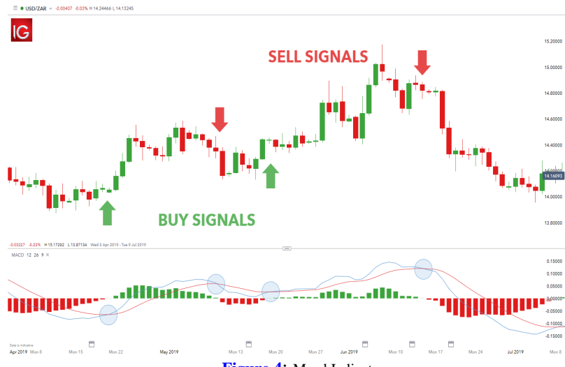
Figure 4: Macd Indicator

The trend of financial market charts is often locally approximate to the exponential function chart. One of the best indicators that use the exponential function to approximate financial market charts is the Macd indicator. Figure 4 shows an example of this indicator in the financial market trend.