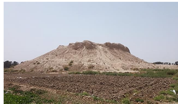
Figure 2: The view of Nizam-Abad (A. Hozhabri, July 2023).

In summary, Tepe Nezām-Ābād (Fig. 2), which contained the unique plaster decorations that gained fame in reputable museums, is actually located in the village of Nezām-Ābād in southern Tehran, and not in the southeastern area about 80 km from Tehran as previously thought by researchers. The precise location of this important archaeological site has now been clarified (Fig. 3).