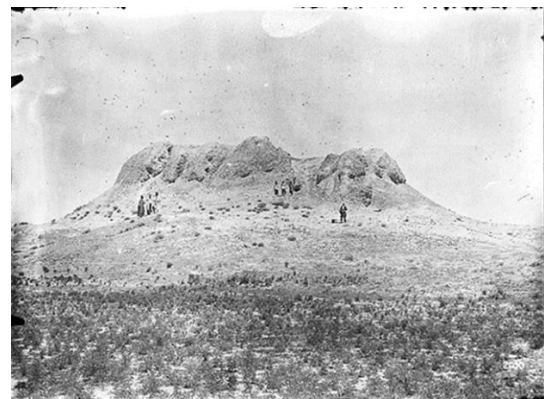
Figure 1: View of Nizam-Abad (Herzfeld, 1925).

Among these, one of the most important sites that displays the transitional period from the Sasanian period to the Islamic era is "Tepe Niẓām-Ābād". A number of unique plaster decorations from this mound were unearthed in 1925, and Ernst Herzfeld immediately went to the site, photographed them (Fig. 1), and purchased as many as possible, transferring them to the Kaiser Friedrich Museum. After World War II, many of these artifacts ended up in the Museum Island in Berlin.