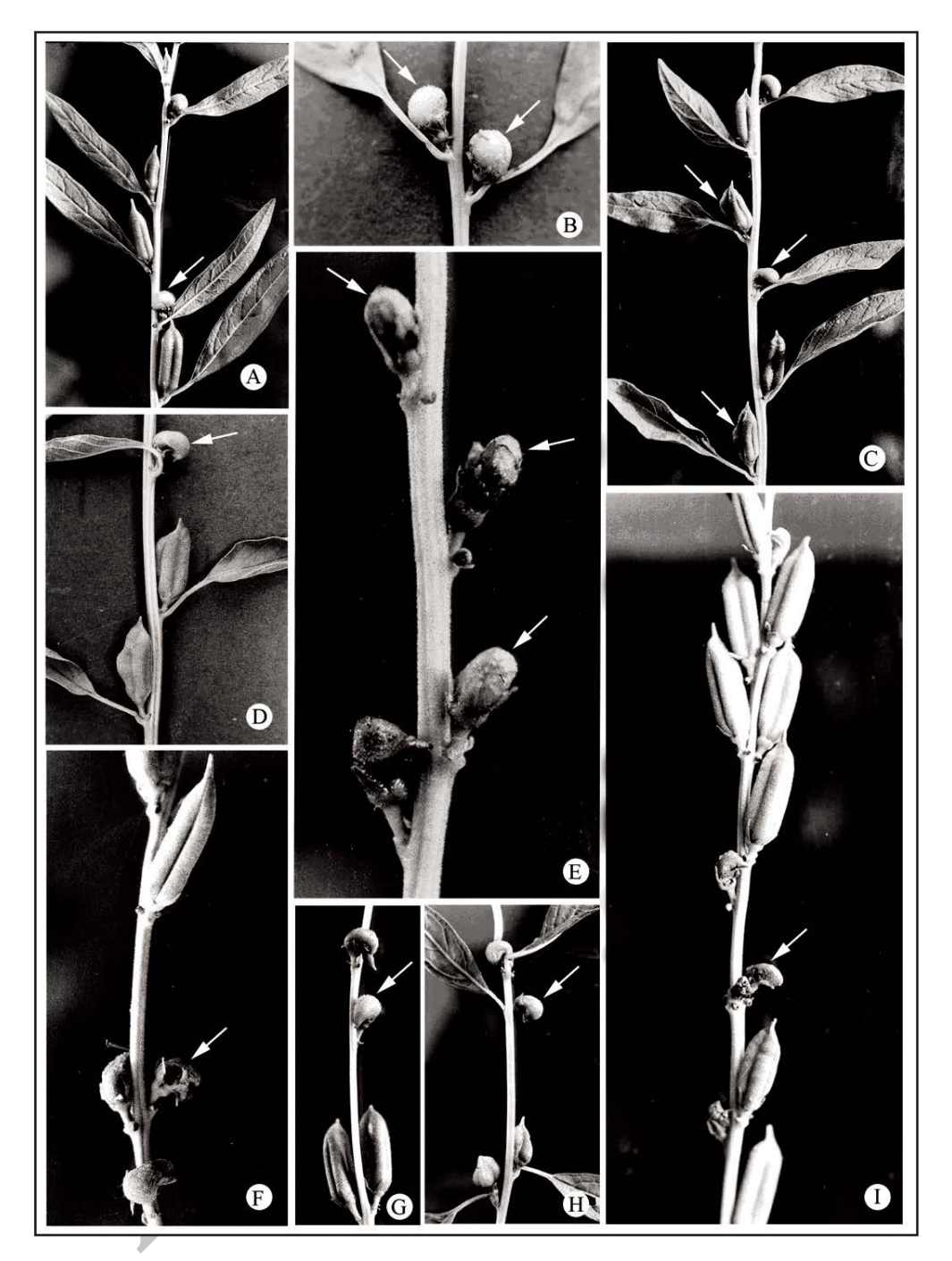
Fig. 1 A-I – Ovary Galls of Sesamum indicum

A. Galls (arrow) and normal capsules intermingled in different nodes X 1