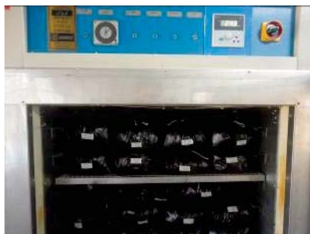
Fig. 1. The storage of scales at polyethylene bags containing cocopeat and perlite (1:1) in 25 °C to induce and produce scale bullets.

Oriental hybrid lily “Arabian Red” bulbs (18-20 cm in circumference, Van den Bos, Netherlands) were scaled. Middle scales on basal plate with same weight (2-2.5 g) were used in this experiment. Scales were dipped for 15 min in a fungicide solution containing 1% (w/v) Benomyl. After air drying, 10 scales were planted in polyethylene bags with some punctures containing \approx 1 liter of moist cocopeat and perlite (1:1, v:v; 85-90% moist). The bags were placed at 25 °C in the growth chamber for 3 or 5 months (Marinangeli and Curvetto, 1997; Fig. 1). After storage duration (3 or 5 months) were recorded number of scale bulblets per scale, number of main roots, lengths of main root (cm), diameter of scale bulblet (mm, Digital caliper, Japan, accuracy: \pm 0.02) and number of scales per scale bulblet. The soluble carbohydrates in the vernalized scale bulblets (2 months at 3-5 °C) were analyzed with following method.