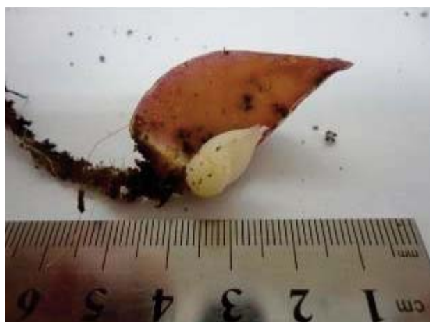
Fig. 3. Scale bulblet at mother scale base of Oriental lily "Arabian Red" after 4 months in 25\text{ }^{\circ}\text{C} .

The increasing duration of storage to 5 months was increased diameter of scale bulblet 4.407% compared to 3 months. The size of bulblet affects the quick and uniform sprout and produce efficiently photosynthesis leaves and bulb enlarge rapidly (Langens-Gerrits et al. , 2003). After scaling, and production of scale bulblets, three different types of plants grow from scale bulblets (Matsuo, 1972; Matsuo and Van Tuyl, 1984; Matsuo et al. , 1989). The scale bulblets that grow in the development of ETP (Epigeous type plant), enlarge rapidly to produce yearling bulblet and forcing sized bulb. These plants produce one foliated stem, other plant is hypogeous type plant (HTP) that has only scaly leaves, and other plants are hypo-epigeous type plants (HETP) that have stem and scaly leaves. Matsuo and Van Tuyl (1984) demonstrated that bulb storage temperature and duration affect on scale bulblet development and type of plant development. Han et al. (2005) reported the normal bulblets formed shoots with one foliated stem, and they grown normally in greenhouse, after cold treatment at 5\text{ }^{\circ}\text{C} for 2 months. Most of the bulblets produced stems with several leaves. These bulblets grow rapidly in soil and they increase the frequency of large commercial bulbs in a short time. Fast growth occurred in large bulblets and in bulblets that formed a