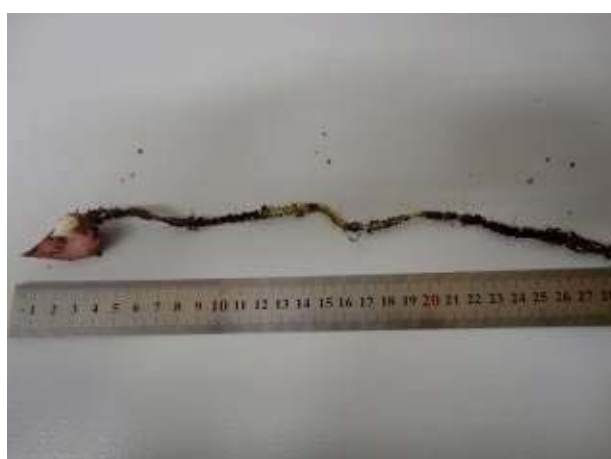
Fig. 4. The growth of root during scale propagation in Oriental lily "Arabian Red" at cocopeat: prlite (1:1) substrate in 25\text{ }^{\circ}\text{C} .