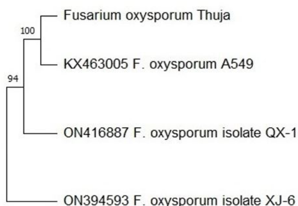
Fig 2. Molecular phylogenetic analysis of F. oxysporum from Thuja by maximum likelihood method comparing with 3 accession from genbank.

After extracting DNA genomic, internal transcribed sequence region was amplified using ITS5 and ITS4 primers. Using blast search tool, the isolate of Fusarium oxysporum in the gene bank had 99 % overlap and high similarity. Three most similar sequences from the ITS region of isolates of F. oxysporum ; small subunit ribosomal RNA gene, partial sequence; internal transcribed spacer 1 and 5.8S ribosomal RNA gene, complete sequence; and internal transcribed spacer 2, partial sequence, were selected for phylogenetic analysis included; isolate A549-genbank: KX463005.1, isolate QX-1 ON416887.1 and isolate XJ-6: ON394593.1. The phylogenetic results confirmed the correct molecular and morphological identification of the species (Fig 2).