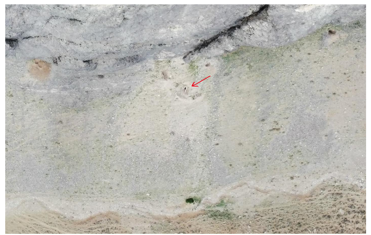
Figure 4: Secret corridor entrance on the western slopes of Tos-i Nowzar.

foundries, and pottery production. Kilns and brick-making facilities were identified outside the walls of the lower part of the valley, specifically to the south and southeast of Tos-i Nowzar Castle (Trinkaus, 1981, 1986; Bahrami, 1988; Ricciardi, 1970; Lecomte, 1987; Priestman, 2013; Kennt, 2004; Wilson, 1963; Wilkinson, 1973; Whitcomb, 1985) (Fig. 6).