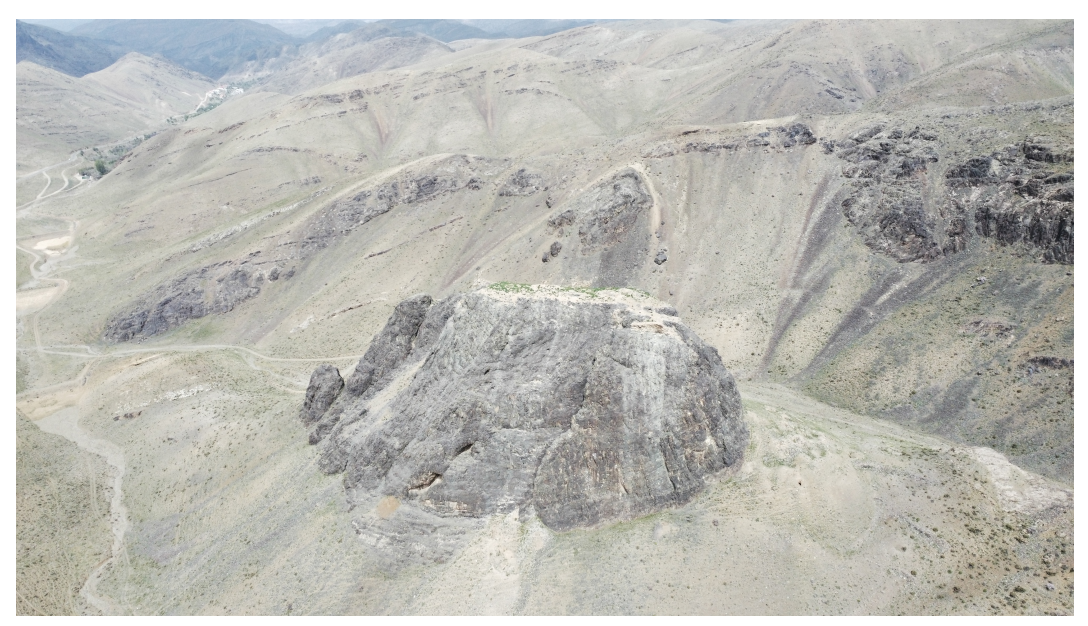
Figure 2.1: Full view of the Tos-i Nowzar Castle and surroundings.