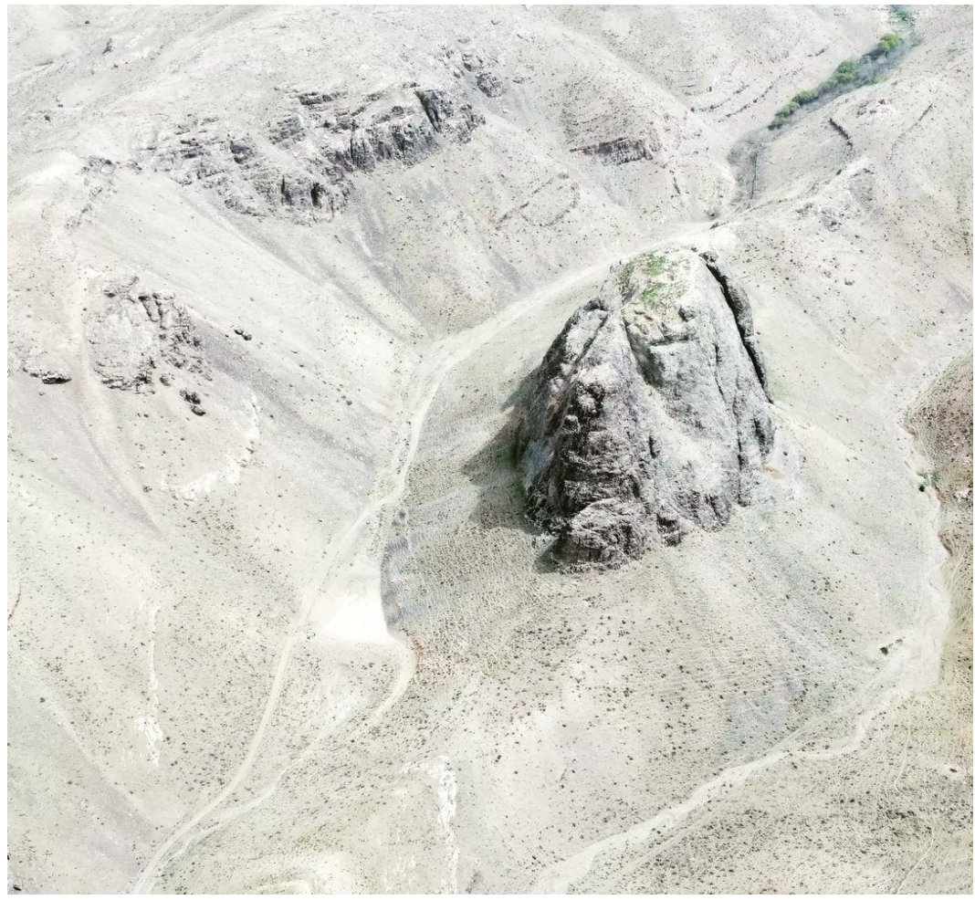
Figure 2: Full view of the Tos-i Nowzar Castle and surroundings (Author, 2022).