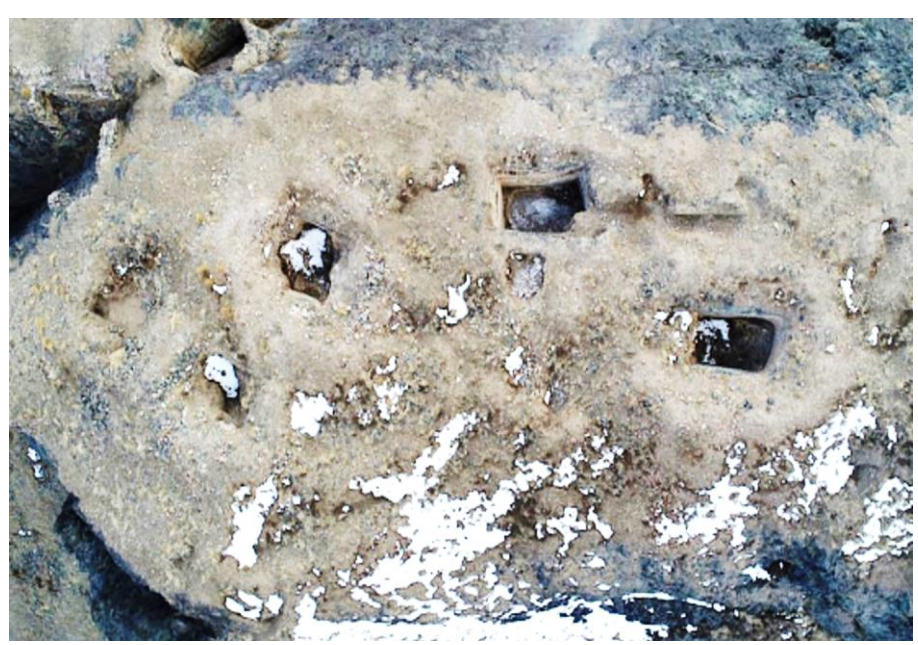
Figure 3: Water Source in citadel of Tos-i Nowzar Castle (Author, 2022).

All these spaces were protected by a stone wall and rampart reinforced with mud mortar. However, due to natural erosion and the passage of time, much of the area has been covered by soil, making it difficult to determine the exact locations of entrances and pathways.