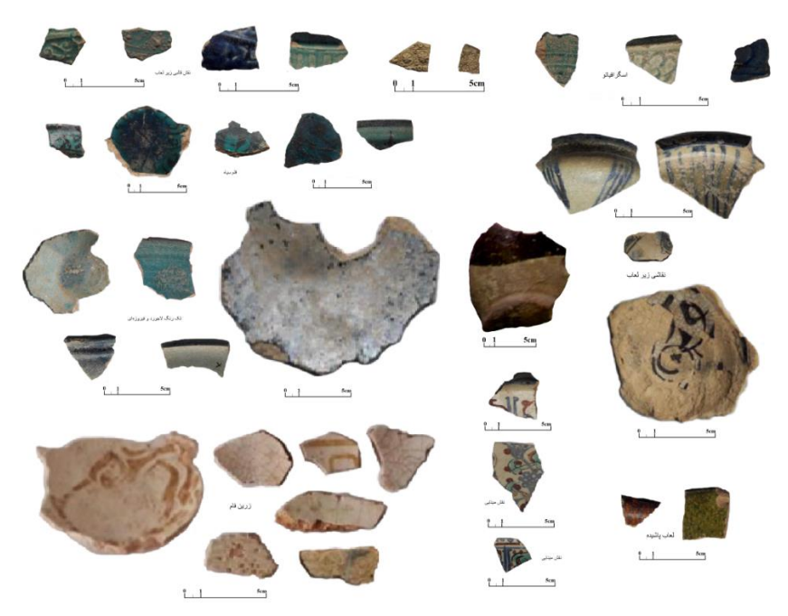
Figure 6: Islamic pottery of Tos-i Nowzar castle.