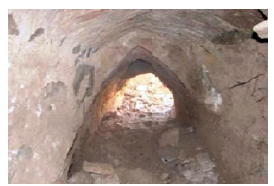
Figure 5: Secret corridor in the western slope of Tos-i Nowzar Castle (Author, 2022).