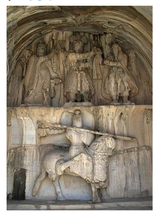
Figure 3: Khosrow Parviz riding on Shabdiz with the holy Farr halo around his head (photo by the author).

These arches and paintings were built during the reign of Khosrow Parviz (AD 590-628). The wall in front of the large Taq is horizontally divided into two parts and two hunting scenes are carved on the side walls. The upper scene on the opposite wall shows the assembly of donating the Deyhim to the king. In this relief, Khosrow is standing in the middle, and in his hand is the king's crown with a wavy ribbon, which is given to him by the Zoroastrian priest or the manifestation of Ahura-Mazda who is standing on the right side. On the other side of Khosrow Parviz, there is the goddess Anahita, who presents a similar ring to the king with one hand, and on the other hand, she holds a bucket that pours water on the emperor's feet. In the lower part of this scene, Khosrow Parviz is sitting on his big horse Shabdiz and a halo of light is shining around his head. While he is wearing a full battle dress, he is holding a long spear. This relief is four meters high. The king wears a crown in this relief. A relatively large orb can be seen on top of the crown. Below this orb is a wavy ribbon that has been blown by the wind. The wind is a representation of the existence of God Vayu, which includes the sacred Farr next to the emperor (Fig. 3).