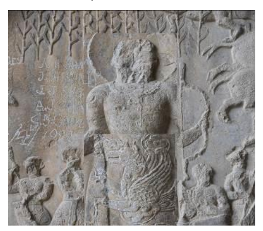
Figure 4: The motif of Simorgh in the costume of the emperor Khosrow Parviz in Taq-e Bostan (photo by the author).

The Sassanid emperors considered themselves sacred as gods and heavenly beings. Khosrow Parviz shows himself in the upper part of the large Taq next to the celestial beings on the top of the Taq, which is an allegory of the sky. The cave symbolizes the dome of the sky and the world of creation. Mithra started creation in a cave with a cow sacrifice (Bondaheshn, 2001: 66; Komen, 2004: 138).