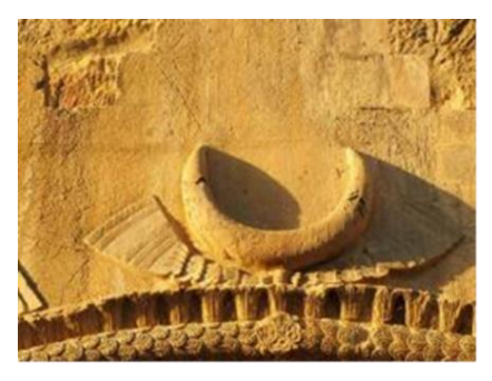
Figure 2: The crescent moon motif with a ribbon above the opening of the large Taq of Taq-e Bostan.

In the Avesta creation myth, the sacred cow called Thor lived next to Kiyomarth. Ahriman killed Kiyomarth and the first cow. The two Amshaspands, the holy angels of the Zoroastrian religion, took the seed of Kiyomarth and the first cow from their bodies. They were taken to the moon and purified from pollution in the light of that holy place. As soon as Ahriman left the earth, that seed was protected in the bright light of the moon (Bondaheshn, 2001: 70). When the filth of the devil was removed from the earth, those two holy angels kept that seed in the heart of the earth for forty years. After forty years, 15 leaves of Ribas (sacred plant) grew from that seed. The entry of Ahura's Farr and wisdom into the plant creates a wise man (Bondaheshn, 2001: 81; Zādspram, 1987: 16; Shahrestani, 1982: 1/396; Shortheim, 2008: 85) (Fig. 2).