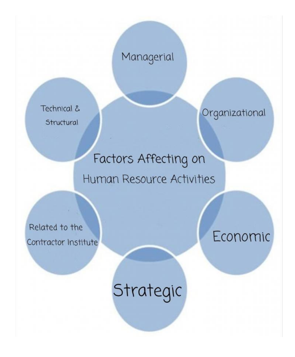
Figure 2. Original research conceptual model (Grover, Cheon, M & Teng ,2017, Lee ,2017, Kshetri ,2017)-Sivakumar & Roy,2017)

So the following hypotheses are suggested according to what has been said: