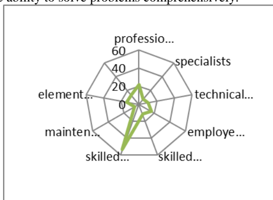
Fig. 2. Load level per one vacant workplace by occupational groups, on average for 2013-2018, pers. Built by the authors based on the data from the official website of the State Statistics Committee of Ukraine. URL: http://www.ukrstat.gov.ua/

the employers concerns such competencies as critical thinking and the ability to solve problems comprehensively.