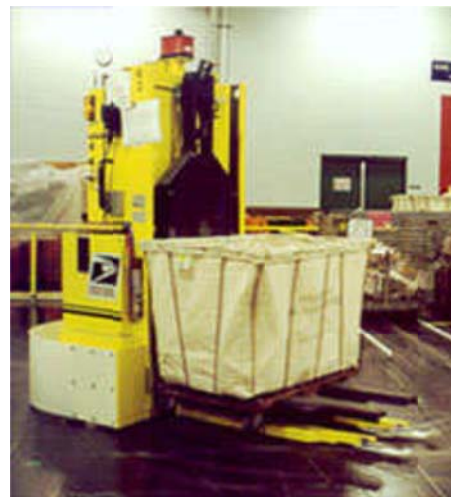
Fig. 1. An overview of an AGV handling system

We proposed parallel automated assembly lines to produce multiple products in a flexible manufacturing system. For each product, an automated assembly line is configured including several stations. Although parallel assembly lines are configured gradually and considering the promotion in technology, rise in the customers demand, and new product development process, some stations or machines may be used commonly among the assembly lines due to high expenditures incurred in buying a separate one for each line. The products are dispatched to the corresponding assembly line by autonomous guided vehicles (AGVs), and then carried to the next station. The cycle time is computed for all processing activities to fulfill production plan and satisfy demands of various products produced in different assembly lines. In this proposed problem, the assignment of multiple AGVs to different assembly lines and the stations is an aim. To conceptualize the proposed system, dispatching rules decompose the product/station assignment into station routing and product dispatching. Resources and tasks are assigned sequentially while interaction is made between AGVs and stations. An overview of the AGV handling system is shown in Figure 1.