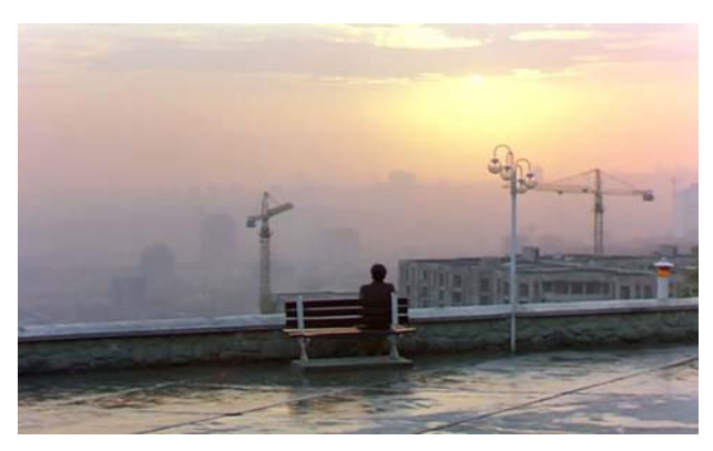
Fig. 6. Polluted cityscape of Tehran in "Taste of Cherry."

As a consequence, Tehran can be an exquisite example for understanding poverty and social difference concepts. In "Crimson Gold" social class conflicts exaggerated to the point that the main character preferred to kill himself instead of living in this city. Some other directors such as "Abbas Kiarostami" attached another perceptual meaning to Tehran. In "Taste of Cherry" Tehran resembled as a place suffered from lifestyle changes that direct people to suicide and depression. Furthermore, in this movie public places are used to induce symbolic meanings. "Dar Abad Wildlife and Nature Museum" take a symbolic role to show that the people who live in Tehran are almost the same as dead animals maintain in this museum, also polluted cityscape of Tehran was captured from this museum, to reinforce the sense of depression (Fig 6).