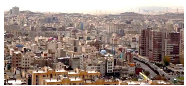
Fig. 7. Cityscape of Tehran captured in "Melbourne."

Iranian filmmakers, especially in these award winners and prominent works, get advantaged from aesthetic potentials of cities. As mentioned before, cities presence in films can be categorized into two groups of Tehran and southern coastal cities. The visual language of these two types is different. In Tehran because of its large expansion, and diversity of views usually wide panoramas from cityscape are so desirable. For instance, in "Melbourne" the first sequence is the silhouette of Tehran (Fig 7). Other desirable views of Tehran are towers and landmarks, which obey modernism rules, narrow old alleys of downtown, which follow the traditional urban design in Iran, and also some famous streets which are fulfilled by cars. According to the analysis, filmmakers did not show any interest in details of urban design and usually they broadcast an overcrowded city via medium or long shots and close shots are not preferable. Additionally, the visual attributes of Tehran came to dialogues of the movies such as "The Last Step." The man says, "Nothing bothers me anymore even the nasty appearance of buildings in the city" (Fig 8). Although Tehran has diversity in views and cityscapes, this city does not sound so beautiful among directors.