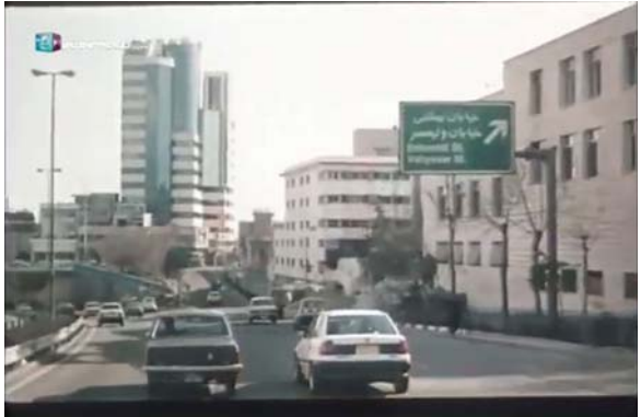
Fig. 3. Using a tower as a landmark in "Under the Cities' Skin."