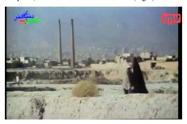
Fig. 5. Suburban area in "The Blue-Veiled."

The last group contains movies which are captured in outskirts of Tehran. In these movies, places do not obey any architectural or urban rules, and they have used primitive unorganized urban design. Their images do not have a detailed structure, and they are full of immigrants, which came from rural areas. These physical environments are symbols of Tehran's disorders and poverty. These places also show neglected theories, about urban development in Tehran which began after the long war. "Rain" and "The Blue-Veiled" movies have several sequences in these areas. In "The Blue-Veiled" brick furnaces located outside of Tehran exhibit and introduce the place, where the main character lives (Fig 5).