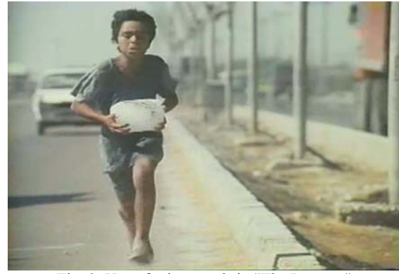
Fig. 2. Use of urban roads in "The Runner."