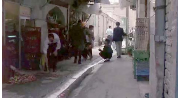
Fig. 4. An old alley in Tehran pictured in "Children of Heaven."

"Captain Khorshid," and "The Jar," are good examples of the second type. Both movies illustrate the traditional physical structure of Bandar Lengeh and Yazd cities.