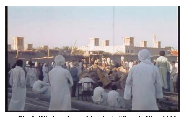
Fig. 9. Wind catchers of the city in "Captain Khorshid."

On the other hand, in southern cities, that harsh looking does not exist anymore. In reality, traditional architecture of those cities and elements like wind catchers created a unique panorama for these cities which has Iranian identity. For example, in "Captain Khorshid" the wind catchers of "Bandar Lengeh" make sense of place and take aesthetic roles in the movie (Fig 9). Furthermore, being located adjacent to the sea made another visual affordance for directors, and all the southern movies get benefitted from this visual potency.