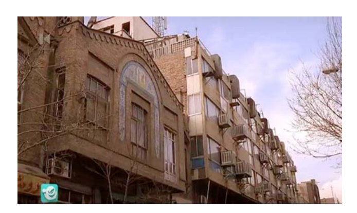
Fig. 8. Chaotic urban facades in "The Last Step."