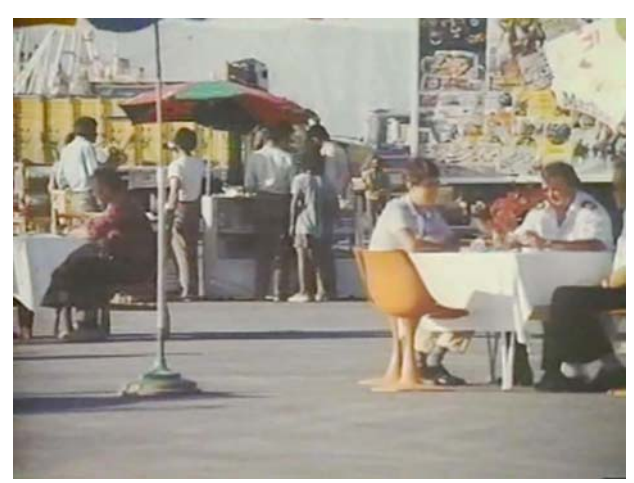
Fig. 10. Public place near the sea in "The Runner."

Moreover, Iranian filmmakers have used urban spaces in their movies, but in comparison with worldwide cinema, this usage is not so impressive. While Iran has near 31 provinces and each province has at least five cities with different types of urban design and architecture, the captured outdoor sequences just limited to Tehran and some coastal cities. So this is a neglected part in interrelationships between cities and Iranian cinema.