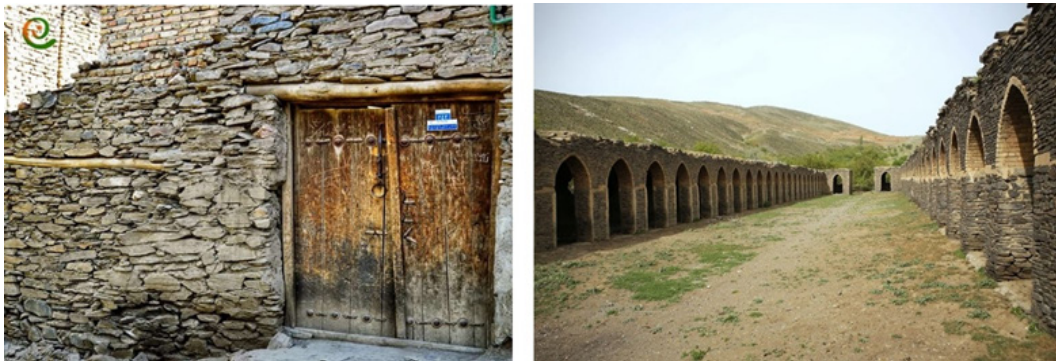
Figure 3. Horse breeding stable, Varkaneh vilage

Varkaneh itself, which is also called Qol Qol spring, is considered as one of the six tourist attractions in Hamedan Province. But, in the heart of this village, apart from its beautiful nature and special architecture, there are other tourist attractions to visit, 2 km from the village, there is a horse stable, which was used for court horse breeding before the Islamic revolution.