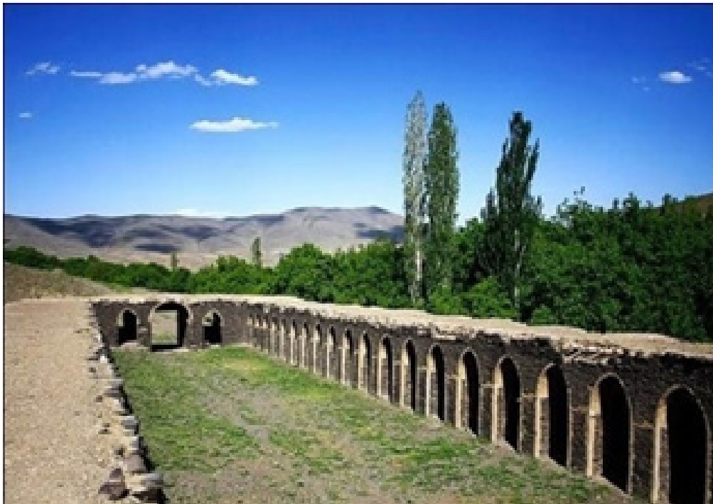
Figure 4. Mehri Khanum Castle, Varkaneh vilage

This stable has an area of about 1650 m 2 and was established during the time of Amir Toman, one of the governors of Hamadan. Currently, this stable is used as one of the village's tourist attractions. In this village, there is a simple cemetery without any tombstones. This is the difference between this cemetery and other cemeteries in the country and has made it attractive for tourists. Another tourist attraction that you can visit in Varkaneh is Mehri Khanum Castle. This