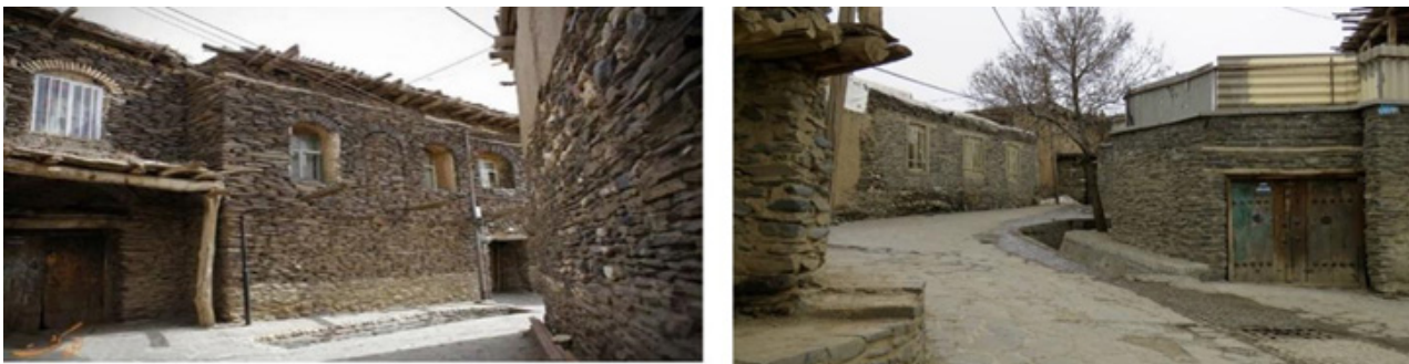
Figure 2. Ston House at Varkaneh village