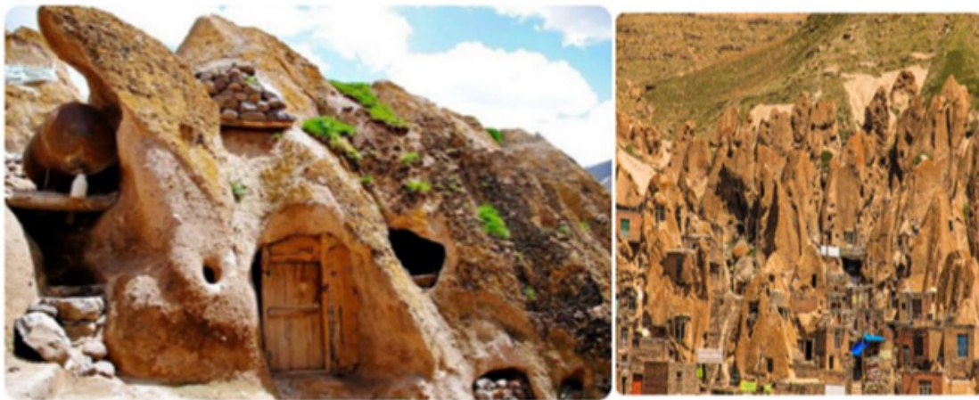
Figure 6. Ston house at Kandovan

castle is an old noble building that belonged to the lord of the village and a person named Mehri Khanum. Mehri Khanum Castle is located 100 m south of the village. It overlooks the village and is surrounded by the green bed of the foothills and the view of the castle is beautiful (Fig 4).