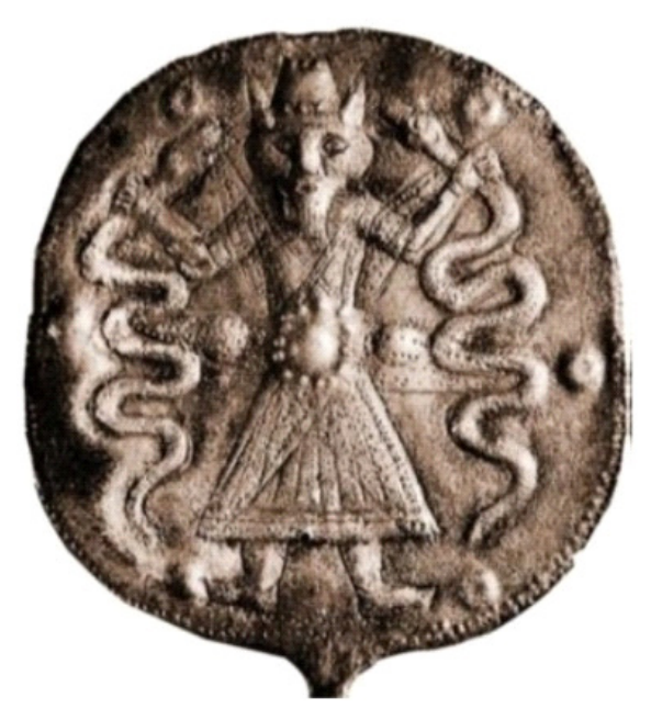
Fig. 6: A human with a Horned Hat Controlling Snakes, 1<sup>st</sup> & 2<sup>nd</sup> millennium B.C., Lorestan