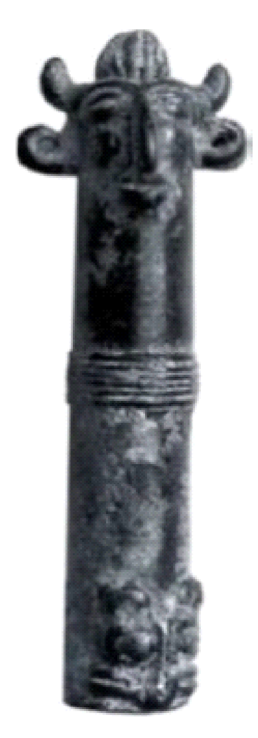
Fig. 5: Idol with Head of horned Human, 8<sup>th</sup> & 7<sup>th</sup> centuries B.C., Lorestan (<u>www.metmuseum.org</u>)