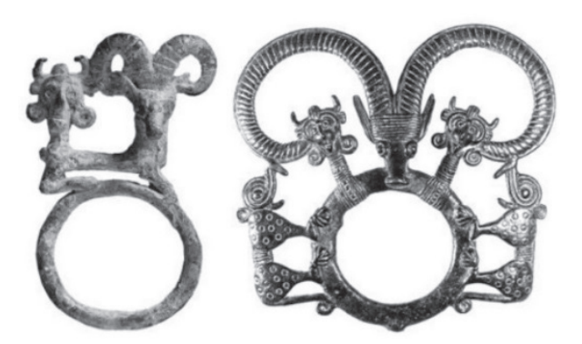
Fig. 8: A horned Human who supporter Domestic animals, Lorestan, 8^{th} \& 7^{th} centuries B.C.

Fig. 7: A horned Human with a Goat character, Lorestan, 1<sup>st</sup> millennium B.C.