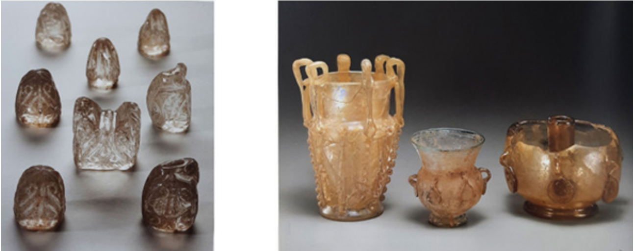
Figure 6: The use of glass in the manufacture of chess pieces also became common (Carboni 2001, 165-167).

were used to store perfume, oil, or mercury. The third group is glass containers with thin walls and no decorations, which are special for distillation and laboratory processes, and were mostly found in the ancient regions of Iran in the fifth and sixth centuries of Hijri. (Madison and Savage Smith 2007, 37).