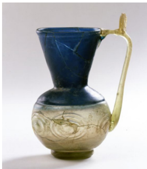
Figure 4: Glass pitcher made by Incalmo method (www.davidmus.dk)