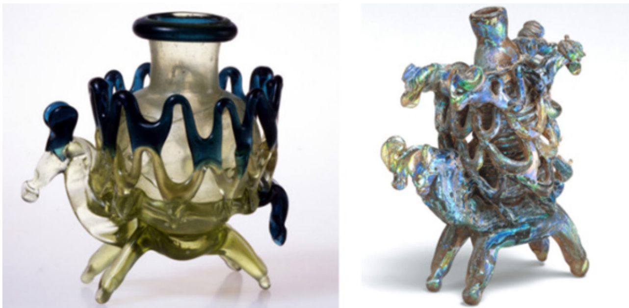
Figure 5: Flask made in the manner of animal forms

Glassmaking is one of the relatively complex traditional industries that is passed from one generation to another, and in the fifth and sixth centuries of Hijri, it developed more rapidly than other arts, and for this reason, the manufacturing methods and decoration methods were considered among the secrets of the workshops. From the creativity of Iranian glassmakers in this period is using additional stripes of two contrasting colors along the same length to make double-walled dishes with animals on the outer wall (Figure 5)