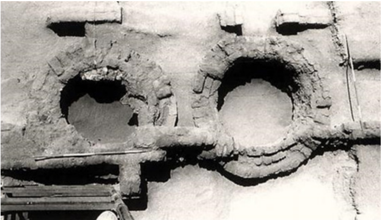
Figure 1. Remains of glass furnaces in Tell El-Amarna, Egypt (Davison, Newton, 2008: 140)

Artistic patterns in glassmaking can be compared with the discovery of glass from Mesopotamia as well as documents recorded in Rome, however, some information taken indirectly from first-hand historical sources talks about the progress of artistic works and their productions. For example, we can mention the order to make glass in Mesopotamia, which conveys the concept that there were three types of furnaces at that time (Oppenheim, 1973). In addition, the Hori Tepe Nuzi area in the north of Mesopotamia shows the first signs of vitrification in West Asia. About 11000 beads, containers and glass objects were obtained from this area. The chemical compositions of these works show that their raw materials were obtained from special sources during the second half of the 14th century BC (Schlick-Nolte and Werthmann, 2003: 19). Also, from Amarna hill in Egypt artifacts related to 14th century BC, glass making from blue glass ingots have been identified in Al-Qantir from the 13th century BC. The glasses obtained from Ashur, Nimrud, Babylon, Eridu and Chogha Zanbil also provide us with information about the materials of the furnaces. These works show that small-scale industrial glassmaking was made on bushes in various forms (Antonaras, 2023: 7) (figure 1).