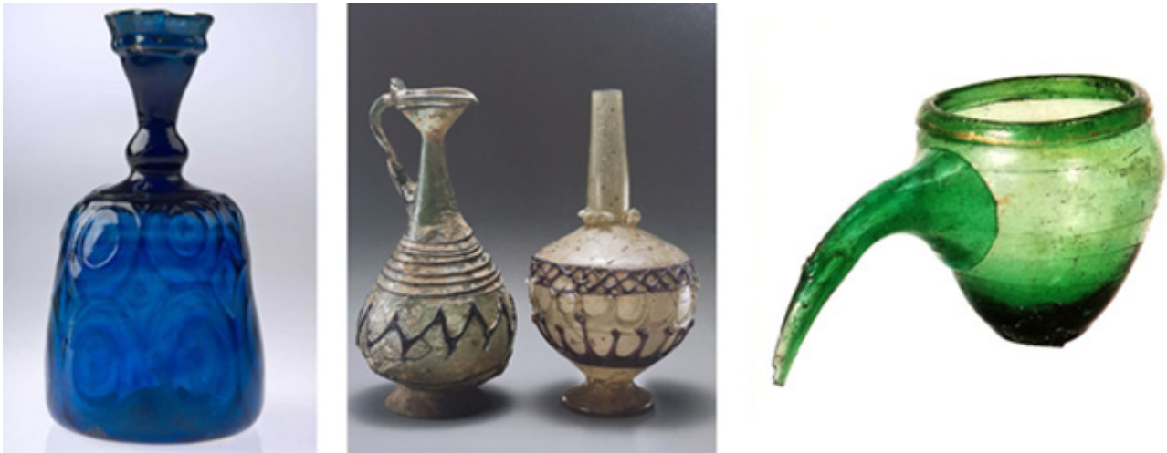
Figure 7. Many glass containers made in different historical periods