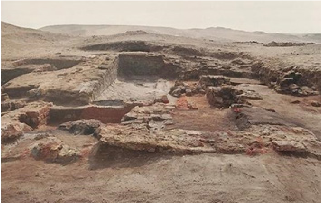
Figure 2. Remains of a glass furnace from Wadi Natron in Egypt (Antonaras, 2012: 8. Fig. 3)

At the end of the first century AD, the use of closed furnaces with a percussive arch (which made glass melting possible) was expanded. Before this innovation, containers and glass objects were probably made in an open fire, similar to the method used by blacksmiths. (Ibid: 23). From the Roman period onwards, more evidence of glass production has been obtained. For example, the remains of a glass production workshop have been discovered from the excavations of Wadi El Natron in Egypt. Chemical analyzes show that the glass objects produced in Egyptian workshops were not exported, but were sold as raw ingots in Syrian-Palestinian workshops of the Roman Empire (Figure 2).