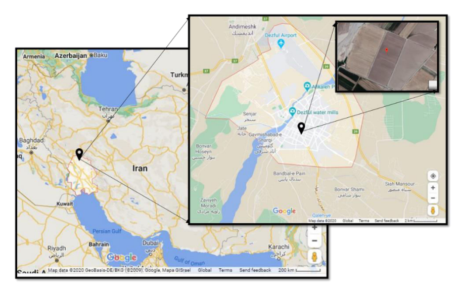
Fig. 1. Location of the study region

The average temperature in winter is 14.9°C and decreases at least sometimes to a few degrees below zero. Which is defined as hyper thermic temperature regime due to high temperature and annual rainfall less than 170 mm. To determine the physical and chemical properties of the soil, five samples were taken from different parts of the soil from a depth of 0-30 cm before the experiment and were analyzed in the soil laboratory of the Research Center. Electrical conductivity of the water and the soil were 0.635 and 4.01 dS.m, respectively. In terms of pH level, the soil was slightly alkaline, its texture was silty clay, and its iron and zinc contents were 0.6 and 1.2 mg.kg<sup>-1</sup>, respectively (Table 1).