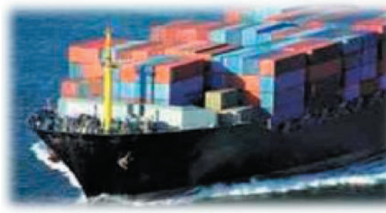
Figure 1. Shipping process in shipping companies

join this system will lose a market share. Since the shipping agencies are impacted by the trading companies, ignoring the containerized system will cause negative effects in commercial transactions of developing countries (Shakibinasab, 2012).