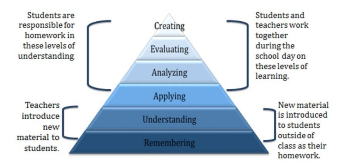
Figure 4. Bloom's taxonomy of traditional and flipped instruction

The flipped classroom model was applied in 2007 by Jonathan Bergman and Aaron Sams, two chemistry teachers living in Colorado. They recorded their class and presentations and put them on YouTube for their students who missed their classes. This method is based on active and groupbased problem-solving activities in the classroom. Many studies investigated the effects of the flipped classroom model on the students' learning and success. For example, Bergmann (2012) after reviewing more than 51 researches during the last five years administered a qualitative study to discover the impact of flipped learning on learners' achievements. He found better results by flipped interactive environments in the 21st century. Since learners have more time to work on their projects. They can work by themselves under teachers' supervision to produce authentic research. (Herreid & Schiller, 2013). Figure 4 presents Bloom's taxonomy of traditional and flipped instruction.