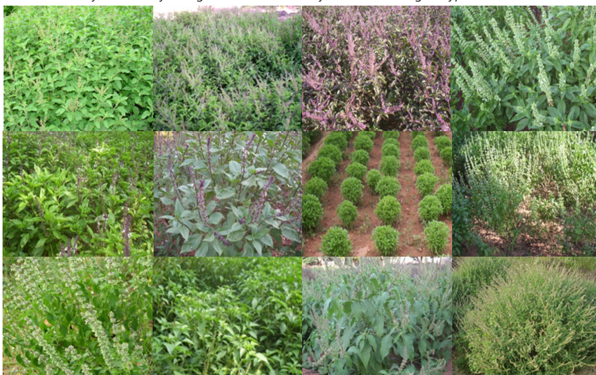
Fig. 2. Genetic variability in Ocimum genetic stocks/germplasm.

Since agro-morphological traits have either a direct or indirect effect on herb and essential oil yield (Lal et al., 2013); therefore it is essential to decide the effects of these traits on yield through appropriate analysis. Path-coefficient analysis is the most appropriate statistical method to facilitate selection criteria to assist plant breeders in identifying traits that are useful for improvements of crop yield (Misra et al., 2013; Singh et al., 2015; Singh et al., 2018; Srivastava et al., 2018). The aim of present study is to estimate the phenotypic and genotypic correlations, heritability (broad sense), genetic advance and breakdown of the direct and indirect effects of yield components with essential oil yield in Ocimum genotypes.