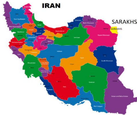
Fig 1: The Position of Sarakhs city

In this regard, the tourism sources and potential in Sarakhs and its suburbs are identified and their effects on increasing the sustainable income of the municipality are studied in this part of the research. The tourist attractions of Sarakhs are among the historical and cultural attractions, man-made attractions and the rest of the natural attractions.