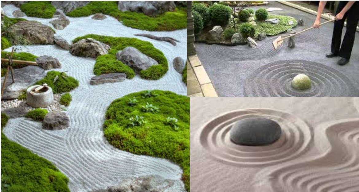
Fig. 2: Sand and gravel, which are reminiscent of the seaside