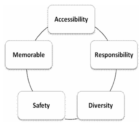
Fig.1: Parameters of questionnaire

Findings show that the highest percentage of clients (%41) that are in age group 45-65 and 26-45 age group has the lowest percentage (%22). The highest percentage of them