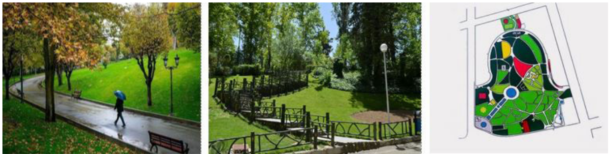
Fig. 2: Examples of park pattern: Left to Right: A View of Mellat Park, A view of Saei Park, Laleh Park plan (Kojaro, 2020)

term "Persian Garden" and its history of 5-6 thousand years frequently believe that thinking of the Persian garden as one of the components of Iranian architecture has begun from the distant past in Iran and gradually developed and improved until the contemporary times while spreading to other territories (Mousavi Bojnordi, 2008).