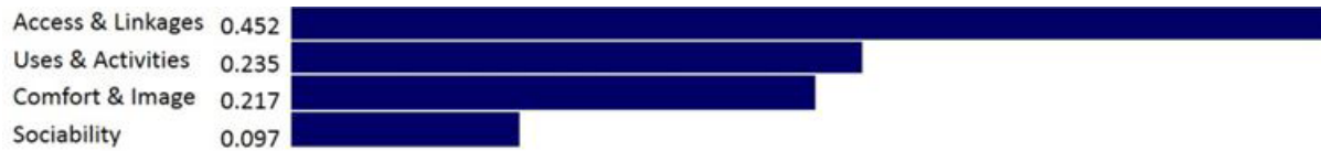
Fig. 3: Final weight and inconsistency rates of main criteria. (Inconsistency=0.04-with 0 missing judgments)