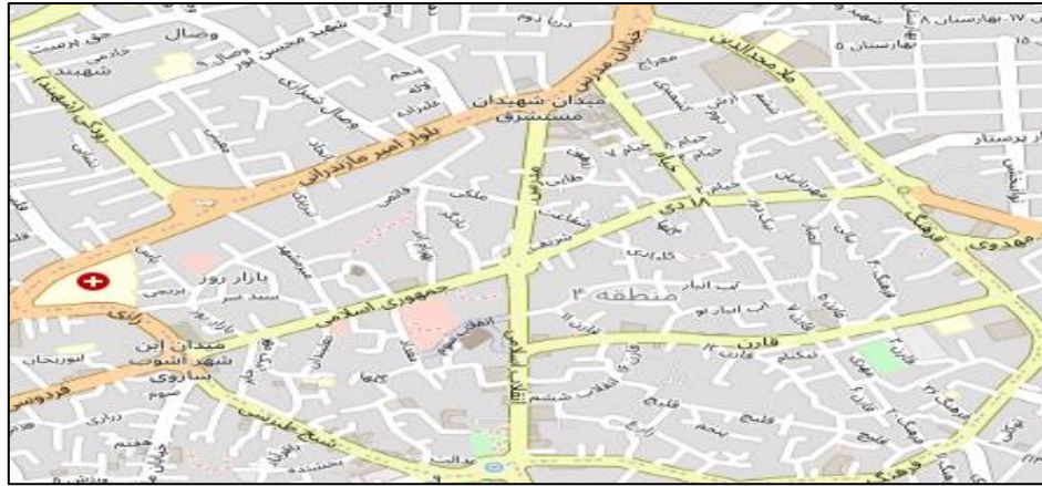
Fig2. Sari city area, (Source: https://gisplus.ir/product )