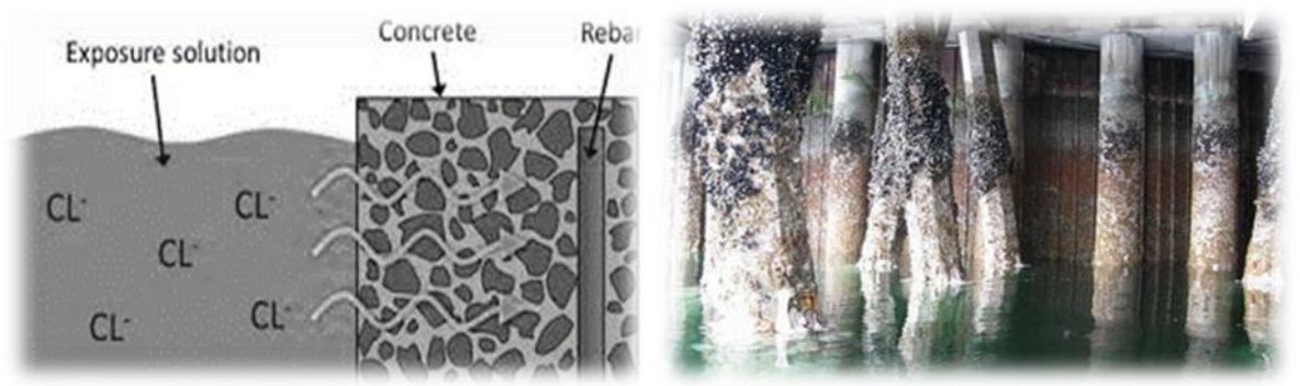
Figure 2: Concrete corrosion in relation to sea humidity and chloride pressure

In general, the effects of using microsilica in concrete can be summarized as reducing permeability, increasing compressive, flexural and tensile strength, increasing concrete resistance erosion, preventing to the penetration of chloride ions, sulfates and other destructive chemicals into the concrete, reducing the heat of hydration, delaying the alkaline reaction of grains, reducing the effect of the freeze-thaw cycle and increasing the cohesion of concrete. Also, the use of microsilica blocks the capillary channels of concrete perspiration (2,4).