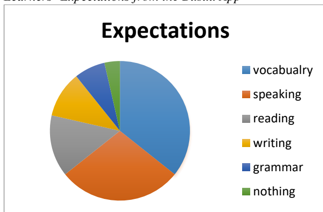
Figure 3 Learners' Expectations from the Busuu App

A total of 28 comments were extracted. The most popular expectation from the app was improving vocabulary knowledge (36%), speaking skills (29%), reading (14%), and writing (11%), followed by improving their grammar knowledge (7%). Ultimately, four percent reported that they had zero expectations. The visual representation of the results appears in Figure 3.