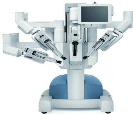
Fig. 2 Image of a multi-nozzle intelligent robot for surgery with multifunctional artificial hand

Fig. 1 shows the mechanism of intelligent robotic surgery, which used as artificial intelligence and biomechanics to easily perform remote surgery for patients in weak countries or patients with mobility problems. In this method, which is given special attention in the health and medical tourism industry, different types of robots with different degrees of freedom (DOF) can be used. In robotic surgeries, incisions may be made on the patient's body to perform the surgery more accurately. In other words, the robotic arms move in such a way that there is no vibration and therefore the incisions may be made in their exact place. However, when the surgery is performed by a physician, the surgeon's shaking hand when making an incision at the