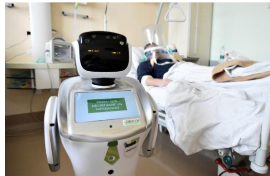
Fig. 3 Robots used in COVID19 duration [35-37]