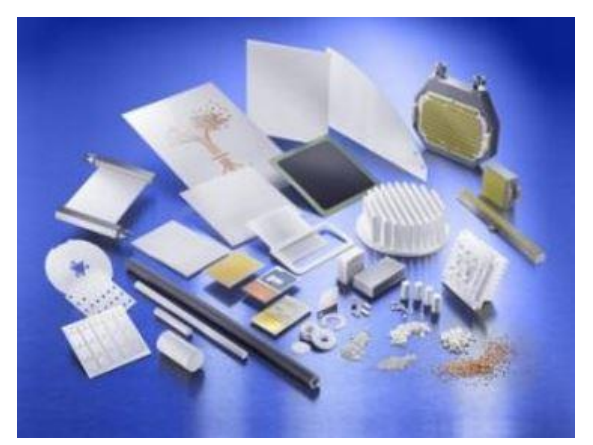
Fig. 4 Schematic of lamps made in which modern ceramics are used [9-10]

electronic packaging, especially for large computers and communication systems [22-29].