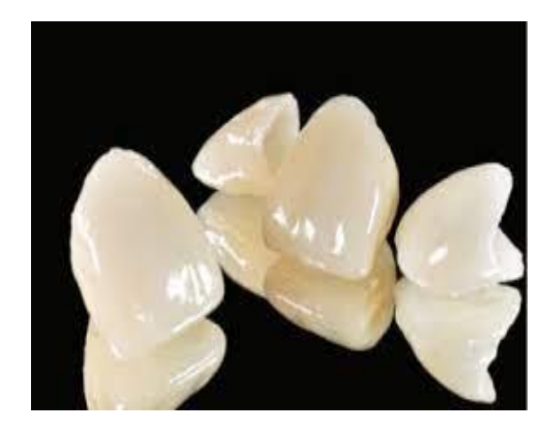
Fig. 6 Ceramic used in dental materials application

Alumina can be bonded to other ceramics or metals by metallization or by hard soldering.