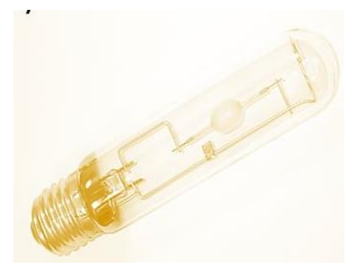
Fig. 2 Use of modern ceramics in lamp [4-7]

Zirconia, along with small amounts of lanthanide oxide (rare earths that can reach high temperatures by passing currents and not being filamentous), is an effective source of white light [33-38]. Conduct electricity well, which is why in the last two decades these materials have been considered because of their crucial role in fuel cell technology, batteries and sensors as shown in Figs. 2 and 3.