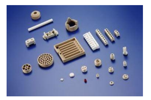
Fig. 5 Electronic components with different dimensions used in the electrical and electronics industry

Researchers and scientists in materials science and physics believe that many of the physical properties of materials are closely related to the microstructure of matter (atomic arrangement, chemical composition, and homogeneity of solid crystalline arrangement in one, two, or three dimensions). Obviously, by accepting such a principle, we can expect the physical properties of a solid to change due to a change in one of the above parameters. In relation to nanomaterials, several reports have been presented about the changes in properties due to these developments, which due to their very interesting applications, many efforts are being made to understand the emerging phenomena created. Changes in the atomic structure of materials play a decisive role in controlling the properties of nanostructured materials.